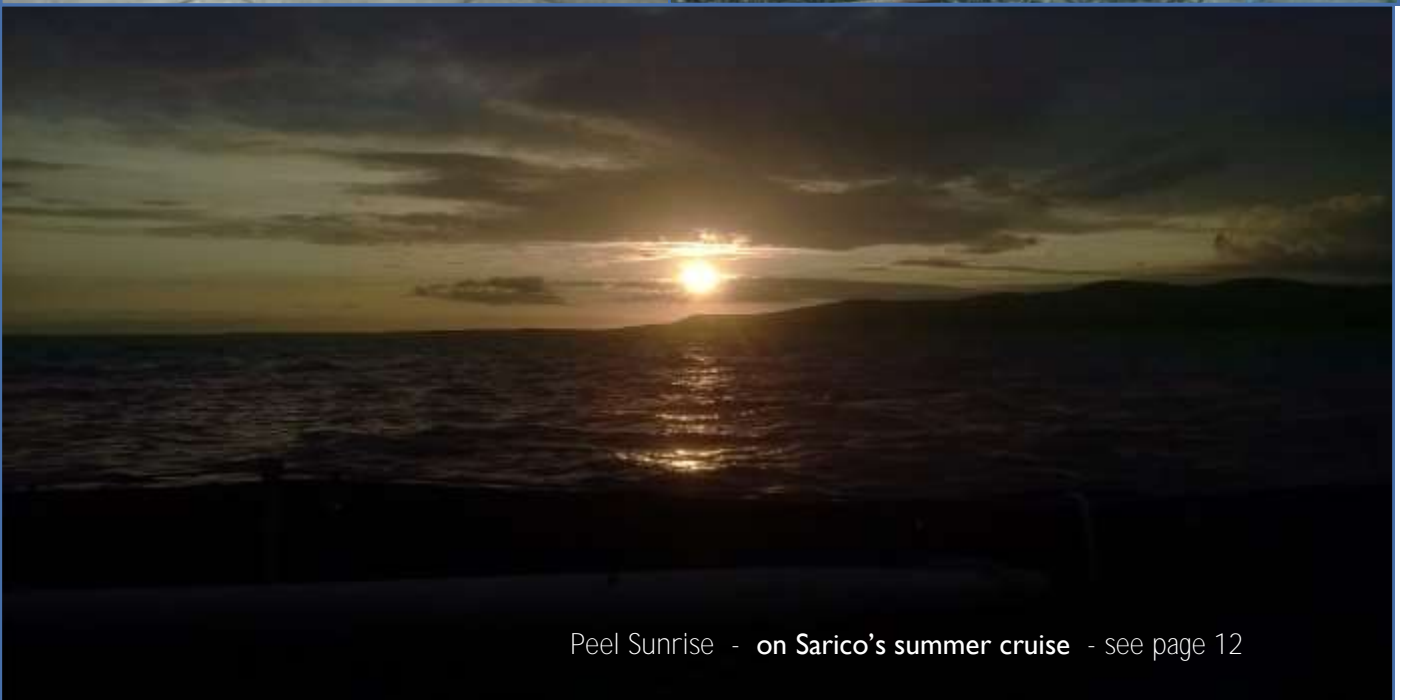
Peel Sunrise - on Sarico's summer cruise - see page 12