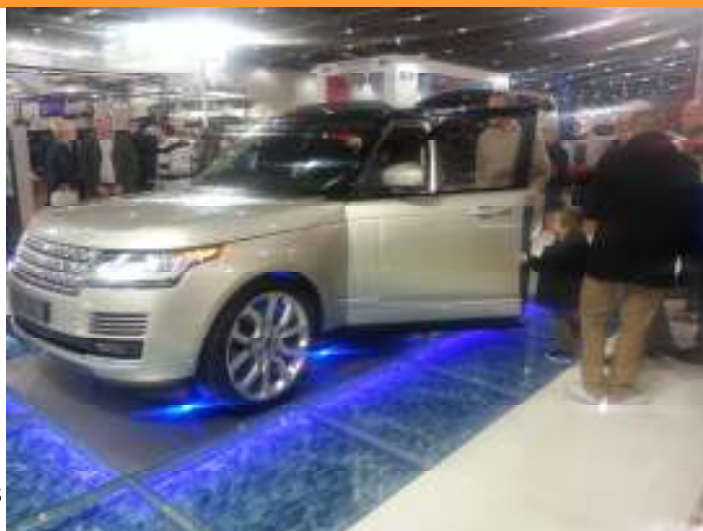
Easier to spot the luxury cars and Jacuzzis than the yachts at Excel

Doing a bit of research on the way home you can do a return flight from Manchester to Dusseldorf for less than £100. Hotel accommodation is about £70/night, and the Exhibition centre, Airport and Town centre are all in close proximity to each other. Long weekend, boat show coupled with sightseeing – wurden wir in Düsseldorf treffen nächstes Jahre?