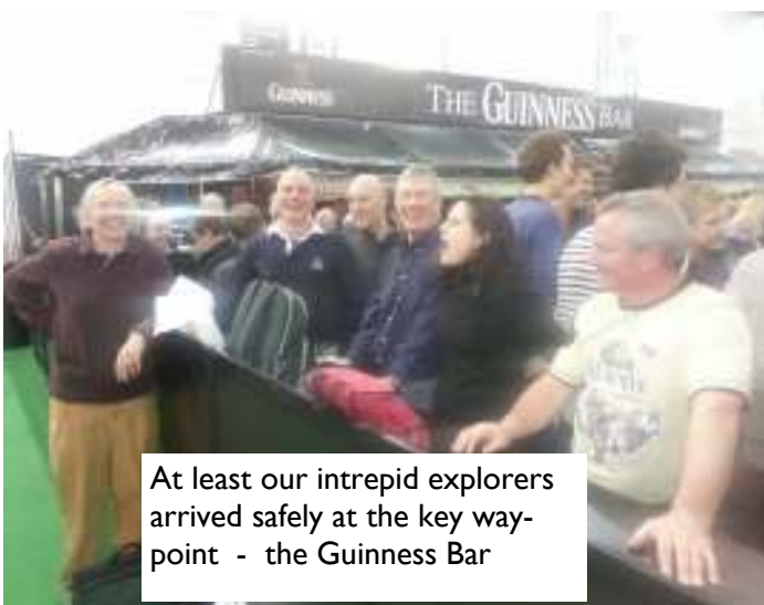
At least our intrepid explorers arrived safely at the key waypoint - the Guinness Bar