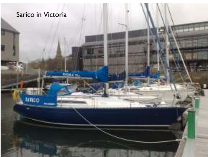
Sarico in Victoria