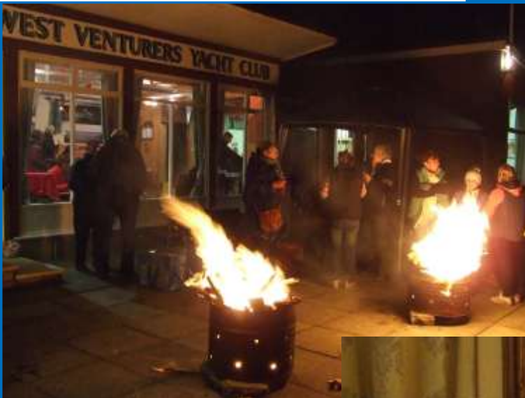
Bonfire night at the Club