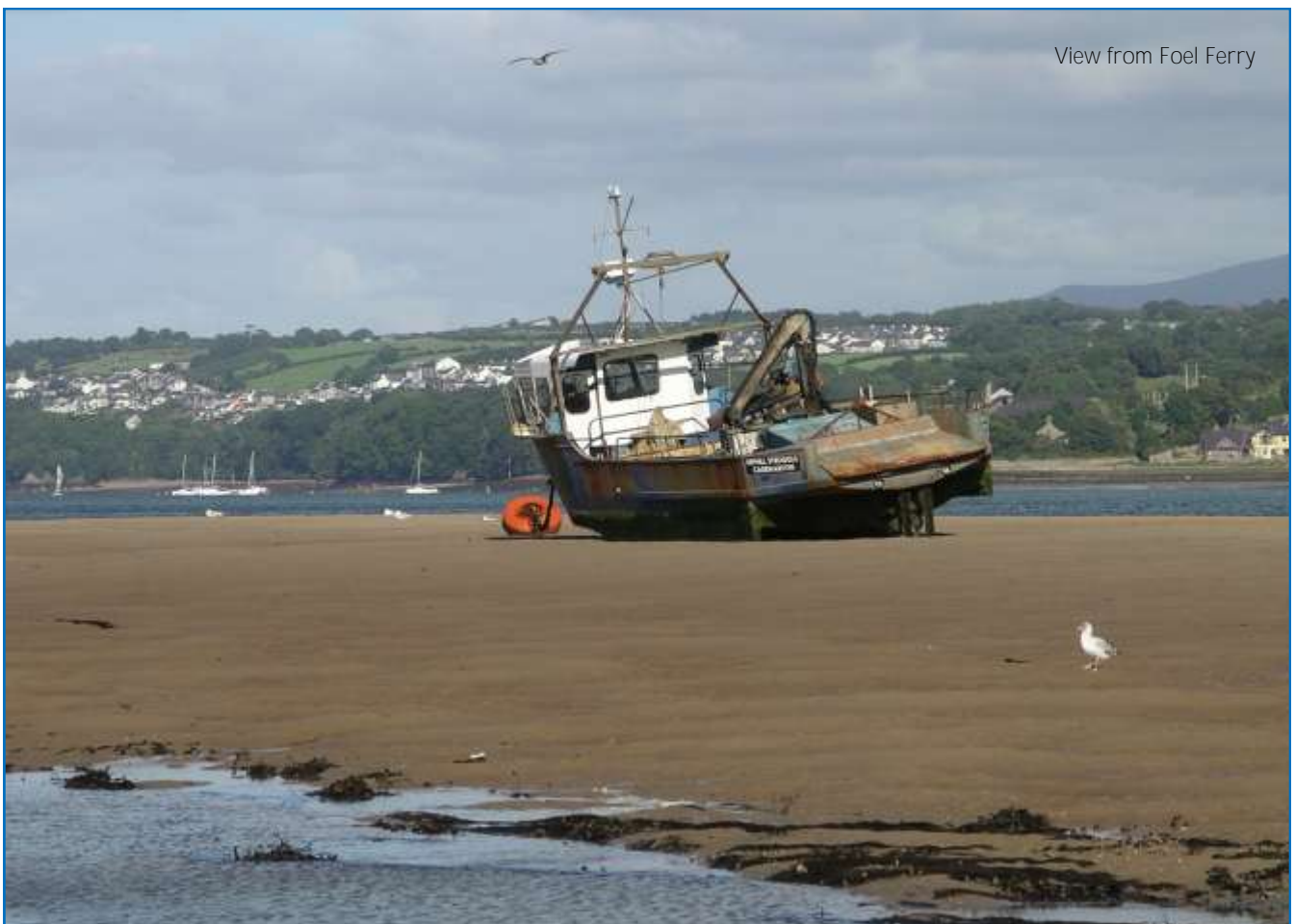
View from Foel Ferry