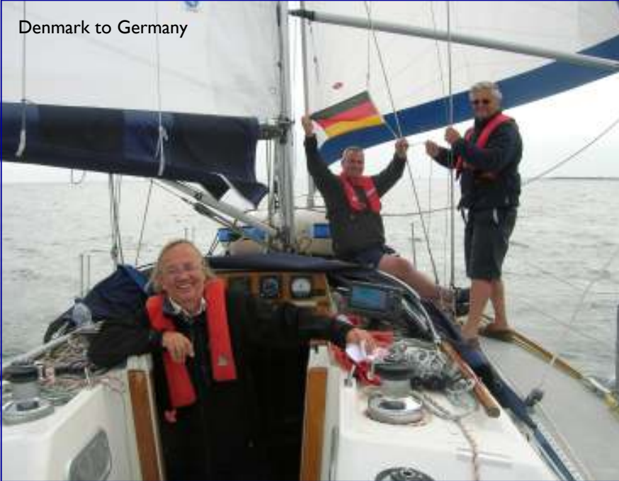
Denmark to Germany