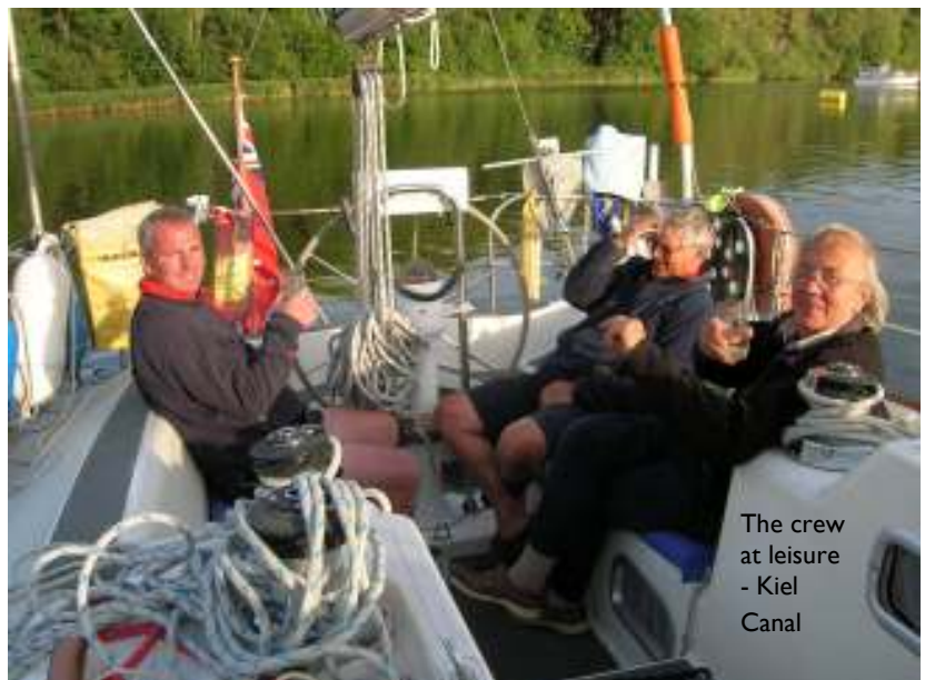
The crew at leisure - Kiel Canal