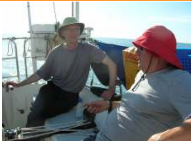
Round the Island? Or maybe not. The story from Ian Banks on Page 2.